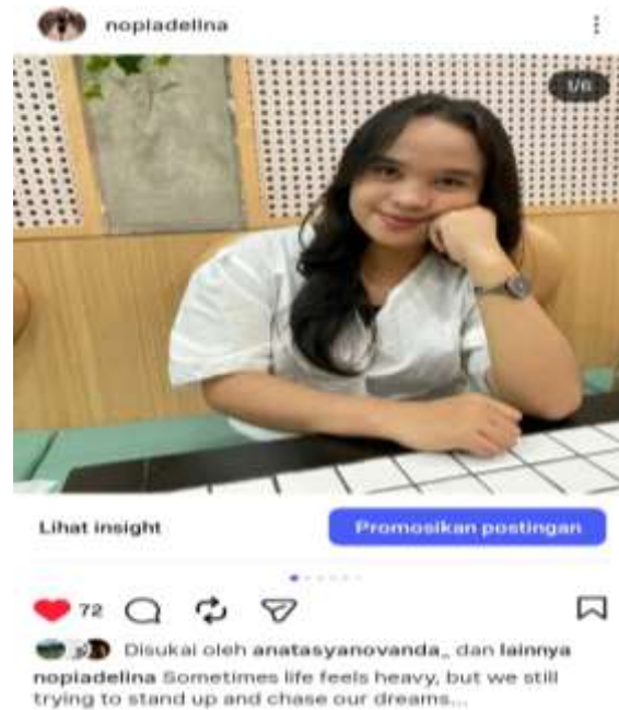
Figure 7. Instagram Caption about dreams

Figure 7. shows an Instagram post uploaded by the user @nopiadelina. The post displays a photo of the user sitting at a table in what appears to be a café or restaurant. The user is posing with a relaxed expression while resting her head on her hand. The environment looks comfortable and calm, suggesting a casual moment captured in everyday life. In the caption, the writer shares a motivational message about life challenges and perseverance. The caption reflects the idea that although life can sometimes feel difficult, people should continue striving to pursue their dreams.