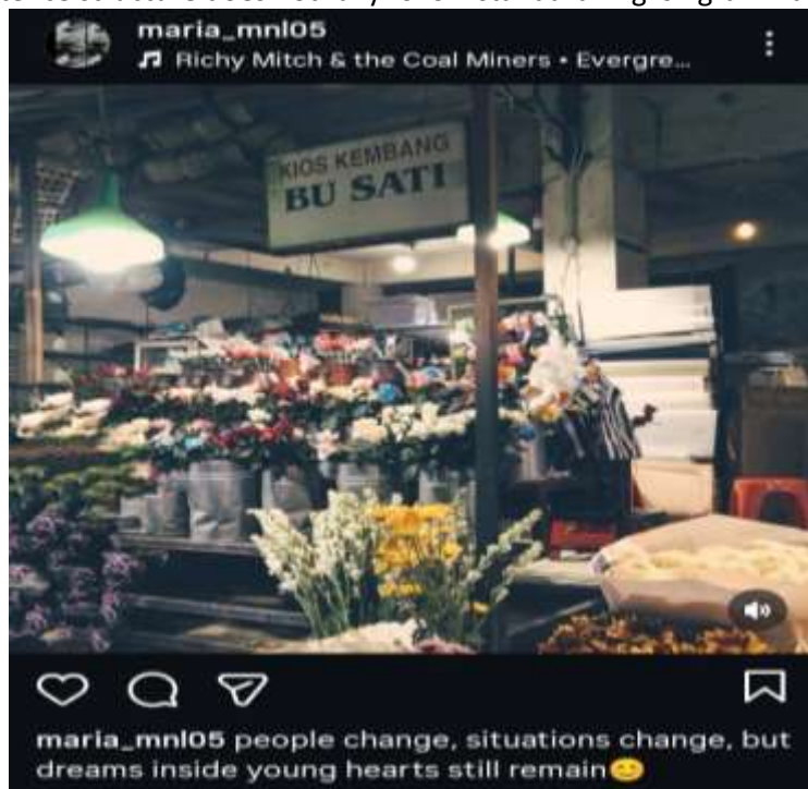
Figure 3. Instagram Caption about Instagram Caption about self-reflection

However, the caption still contains several grammatical errors. For example, the phrase “College life give me many new experience” should be written as “College life gives me many new experiences.” The verb “give” should be changed to “gives” to agree with the singular subject “college life,” and the noun “experience” should be pluralized into “experiences.” In addition, the phrase “how important manage time” should be corrected to “how important it is to manage time.” These grammatical errors indicate that although the meaning of the caption is clear, the sentence structure does not fully follow standard English grammatical rules.