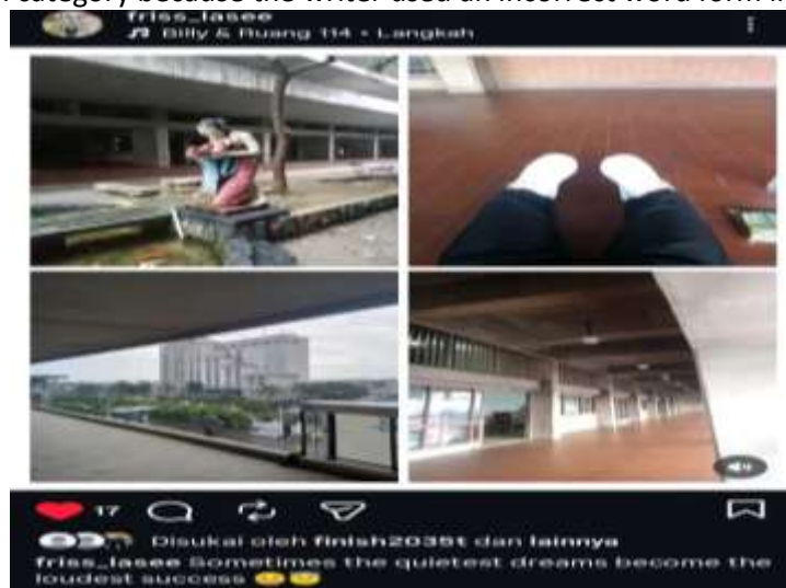
Figure 10. Instagram Caption about

However, the caption still contains a grammatical error. In the phrase “difficult beginning,” the noun “beginning” should be in the plural form because the sentence refers to general situations. The correct expression should be “difficult beginnings.” This error belongs to the misformation category because the writer used an incorrect word form in the sentence.