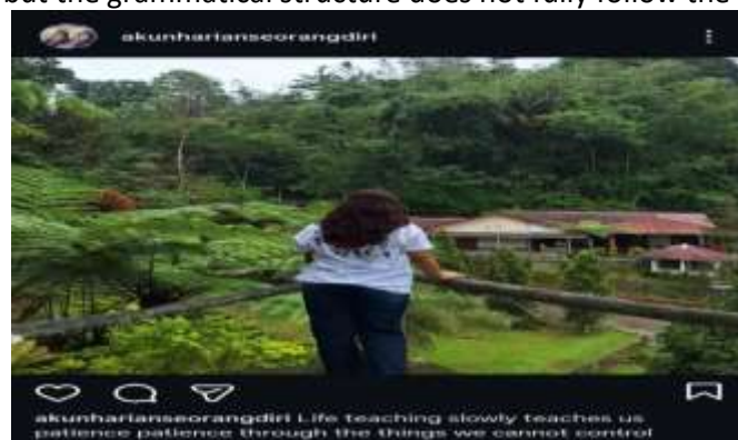
Figure 8. Instagram Caption about life

However, the caption still contains a grammatical error. In the phrase “we still trying to stand up,” the auxiliary verb “are” is omitted. The correct sentence should be “we are still trying to stand up and chase our dreams.” This error belongs to the omission category because the auxiliary verb required in the present continuous tense is missing. The writer intends to express an ongoing action, but the grammatical structure does not fully follow the correct English rule.