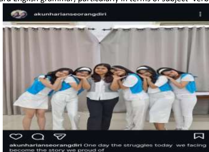
Figure 6. Instagram Caption about a friend

However, the caption still contains grammatical errors. In the sentence “ Success don't come from comfort zone, ” the auxiliary verb “don't” is incorrect because the subject “success” is a singular noun. The correct form should be “doesn't,” so the sentence becomes “ Success doesn't come from the comfort zone. ” In addition, the clause “ it come from courage and persistence ” should be written as “ it comes from courage and persistence ” because the verb must agree with the singular subject “it.” These errors show that although the caption successfully conveys a motivational message, the grammatical structure does not fully follow the rules of standard English grammar, particularly in terms of subject–verb agreement.