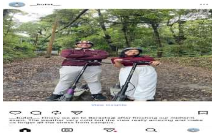
Figure 1. Instagram Caption about Daily Activity