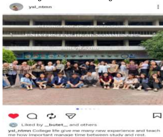
Figure 2. Instagram Caption about Friendship

However, the caption still contains several grammatical errors. For instance, in the sentence “The weather very cold” , the auxiliary verb “is” is omitted. The phrase “the view really amazing” should be written as “the view is really amazing” , and the verb “make” should be changed into “makes” to agree with the singular subject “the view.” These grammatical errors indicate that although the message of the caption can still be understood, the sentence structure does not fully follow the correct grammatical rules of English.