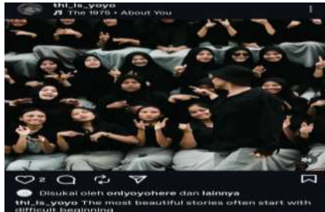
Figure 9. Instagram Caption about friendship

category because an incorrect word form is used in the sentence. In addition, the word “patience” is unnecessarily repeated in the phrase “patience patience,” which is categorized as an addition error because an extra word is added that is not needed in the sentence.