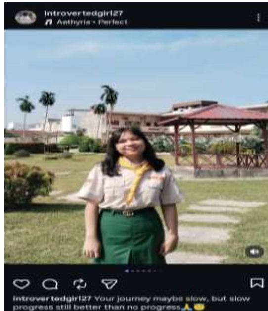
Figure 4. Instagram Caption about Instagram Caption about Motivation