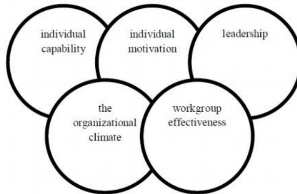
Figure 1. A Climate For The Growth Of Human Capital